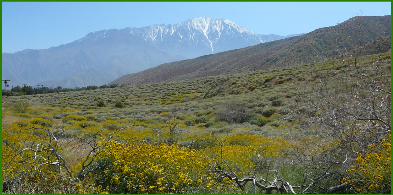
A view of Mt. San Jacinto from the Whitewater Preserve area.